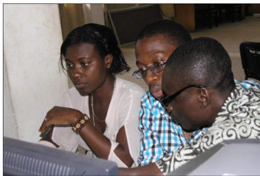
Students examined answers received to questions they posed on PlasmoDB, a functional genomic database for malaria parasites.

Immediate feedback indicated that the course had a strong, positive impact on its participants.